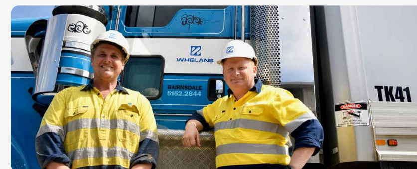
East Gippsland business Whelans sharing in up to $1 million in contracts for the demonstration pit.